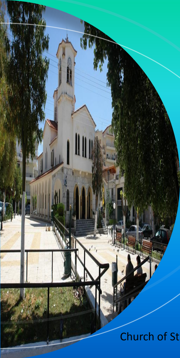
Church of St. John

The modern name "Gerakas" comes from the religious name of large logothetes Hierax (the lerax-Gerax = falcon), who held large areas of the region in the 16th century