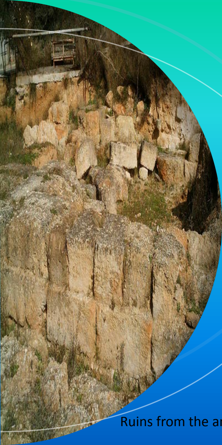
Ruins from the ancient temple of Athena

Others believe that the name derives from Gargittos who was an ancient folk hero.